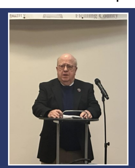
Mayor of Flemingsburg, Van 'Doodle' Alexander