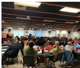
Annual Awards Night