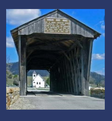
For a full Calendar of Events, please check out the Fleming County Chamber of Commerce website at: www.flemingkychamber.com

The Museum will be open on Wednesday from 10am to 4pm Saturdays from 12pm to 4pm