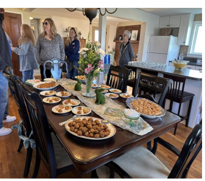
Haymark Farm Stays & RV Park