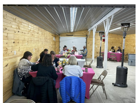
606 Sales and Events